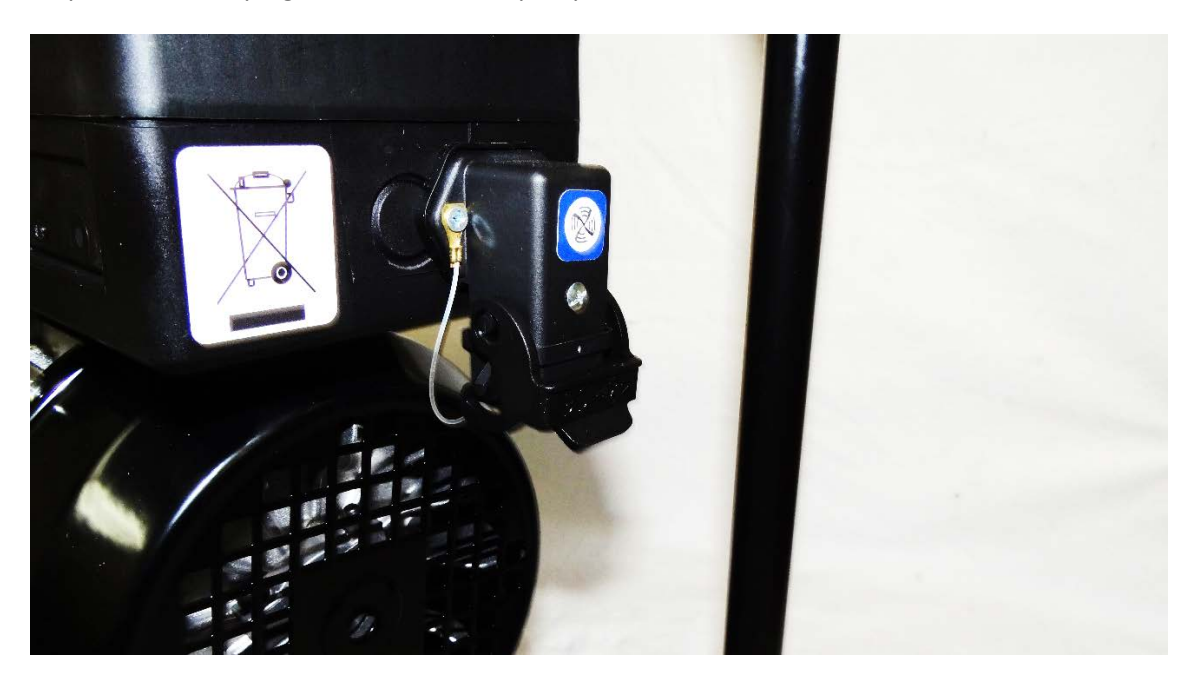
Step 2: Remove the protecter cap