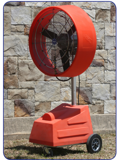
Pump Fan Unit

HydroMist flash evaporation cooling systems are built to be dependable and long lasting—made from high quality materials and high performance pumps and motors. The patented no-drip nozzles prevent wasting water while the pump is not running.