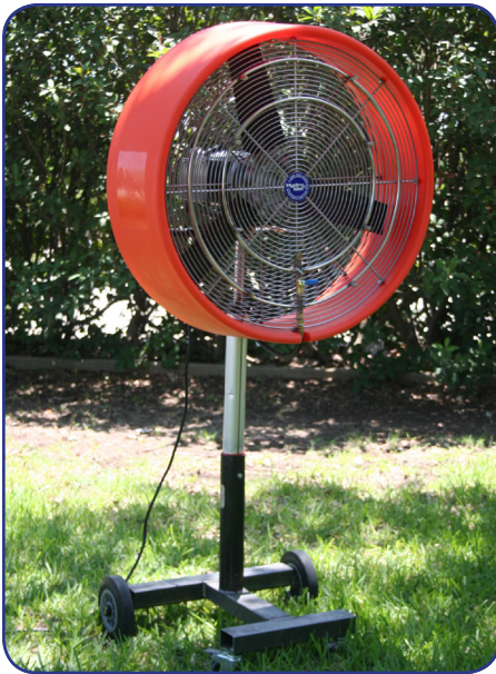
Satellite Fan Unit—no pump

Stay cool and suppress dust & smoke with HydroMist products, the leader of flash evaporation cooling systems. HydroMist products create a very fine misting vapor **or fog** , which through complete evaporation are capable of reducing temperature in the immediate area by up to 30° F (17° C)—even in direct sunlight. Complete evaporation assures no wetting of people or environment.